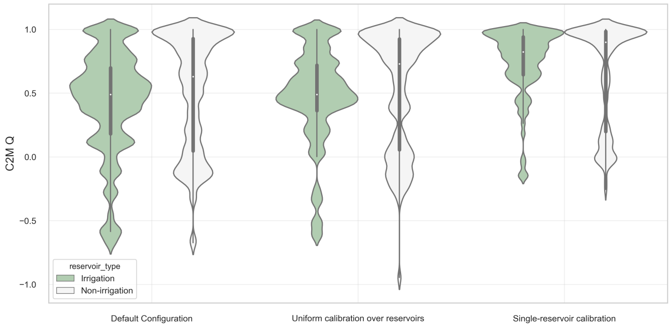
Figure 2. Distribution of the reservoir model performance index C_{2M} over outflows before and after calibration in irrigation (green) and non-irrigation reservoirs (light grey). The default configuration stands for the default setting of the model, the two others are respectively the model calibration performed uniformly on all reservoirs and on each reservoir individually.

30 the optimums of this parameter when running a reservoir-by-reservoir calibration shows that setting a global or regional value limits the performance of the model. This is shown in Fig. 2 where distribution of the reservoir model performance index ( C_{2M} ) is displayed for both types of reservoirs.