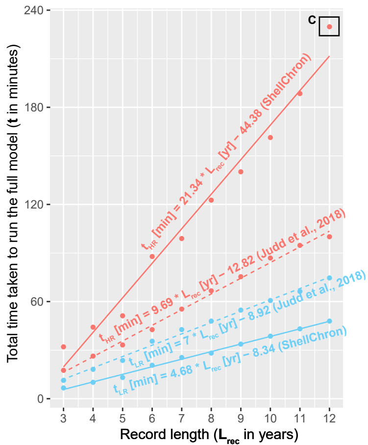
Total time to run the model vs record length in years