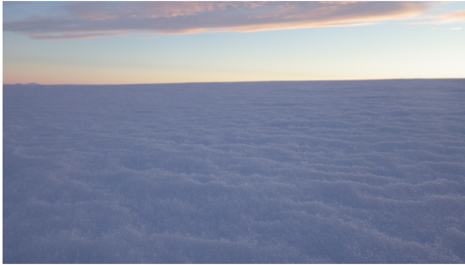
Figure S1. Photograph of the snow surface at D17 in late January 2014 before the beginning of the snowfall and subsequent drifting-snow event.