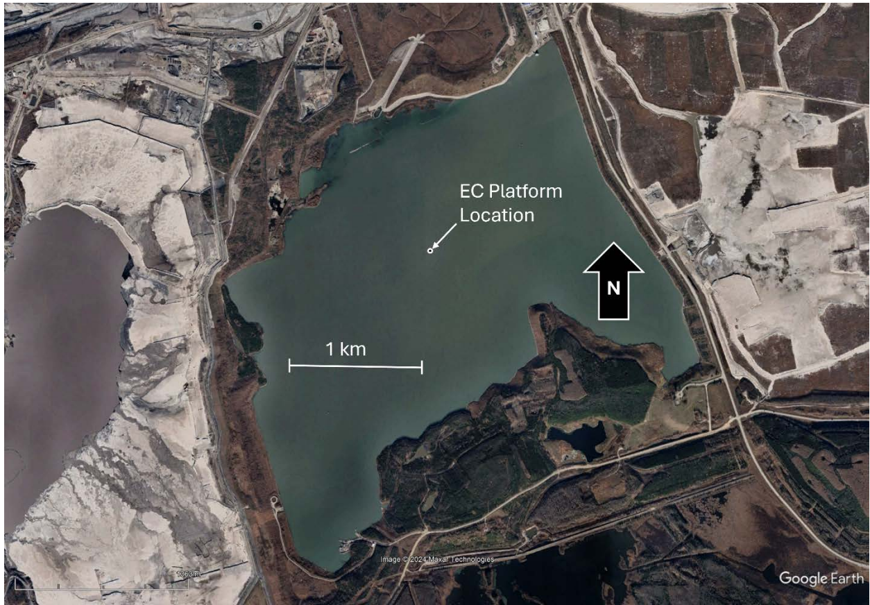
Figure S2: Base Mine Lake, platform location, and surrounding area. Google Earth. © Google Earth