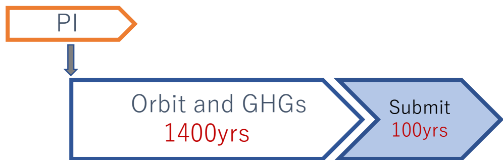
(b) spin-up procedure of 6ka