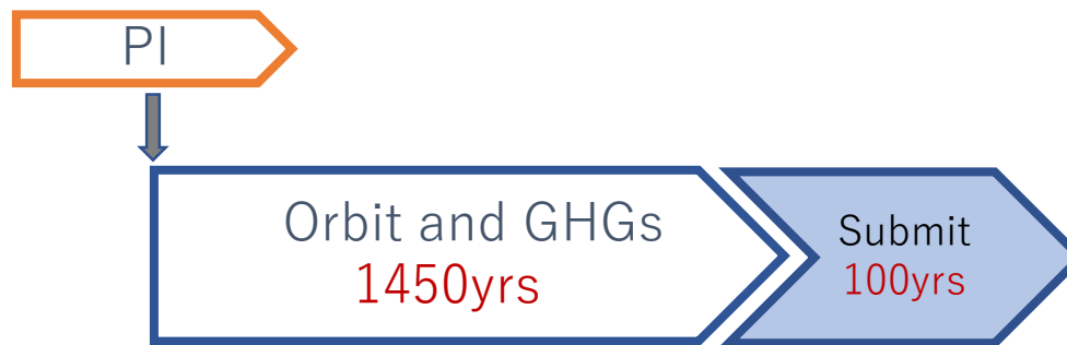
(c) spin-up procedure of 127ka